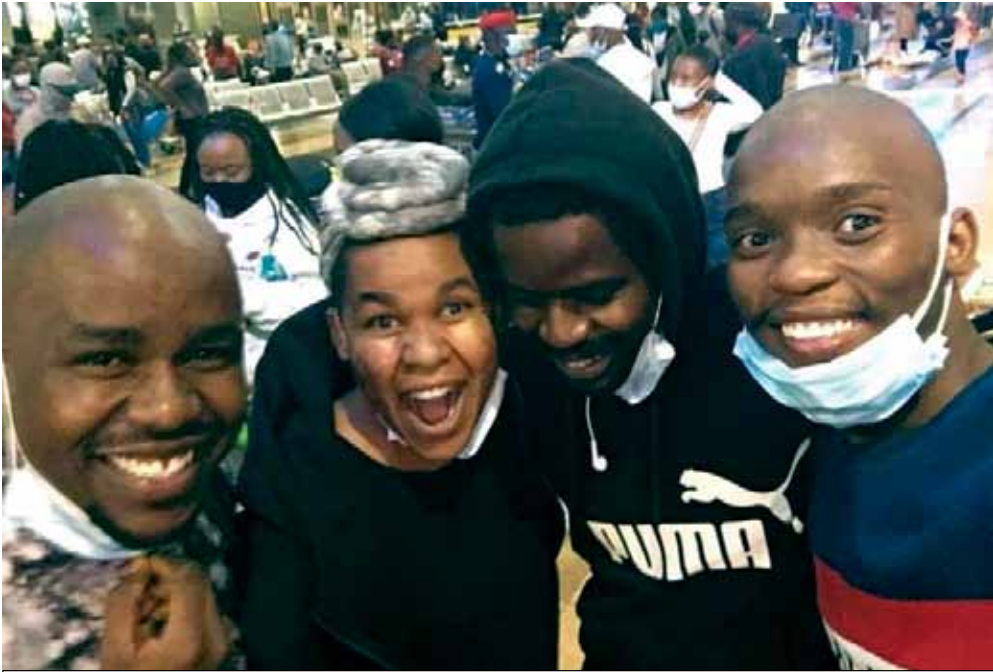
South African students smiling after landing at OR Tambo International Airport.

South African students who were studying medicine in Cuba have finally arrived back in South Africa. The students, who were stranded in Cuba since last year, touched down at OR Tambo International Airport on Friday 6 August, after months of uncertainty with the Department of Health and International Relations Department. The qualified medical doctors have completed their studies and were pleading to return home to their families and do their final year clinical training at local universities. Some of the students have been away for four years. A few weeks ago, Sekhukhune Residence Forum (SRF), raised a concern to the relevant departments about the student's living conditions and frustrations with delayed departure from Cuba. The forum was concerned that the students were subjected to live in deplorable conditions with cramped small rooms and beds, served expired food. "The students were full of joy as they departed the Cuban island and arrived safely in South Africa on Friday. We were concerned because some of these students are coming from Sekhukhune. We hope they will invest their skills in some of Sekhukhune's hospitals and help in the rebuilding of our area's collapsed health services," said SRF Chairperson Makeleketse Phasha. Phasha said they were worried that the stranded students barely had enough money to survive and for them, being back in South Africa is a relief.