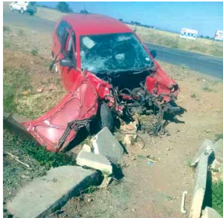
The wreckage of one of the Polo sedan vehicles at the accident scene where three people lost their lives.

Three people were killed and four others escaped with serious injuries in an accident involving two VW Polo sedans.