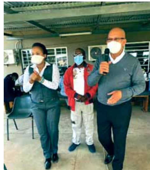
Limpopo Province Premier, Stanley Mathabatha (Right), addressing the farming communities during a vaccination monitoring drive in Groblersdal and Marble Hall. With him is MEC for Health Dr Phophi Ramathuba (Left).

The premier used the platform to welcome the recent cabinet reconfiguration by the President Cyril Ramaphosa. Mathabatha indicated that what is more pleasing about the recent cabinet reconfiguration is that, Limpopo sons and daughters are included both as cabinet ministers and deputy ministers.