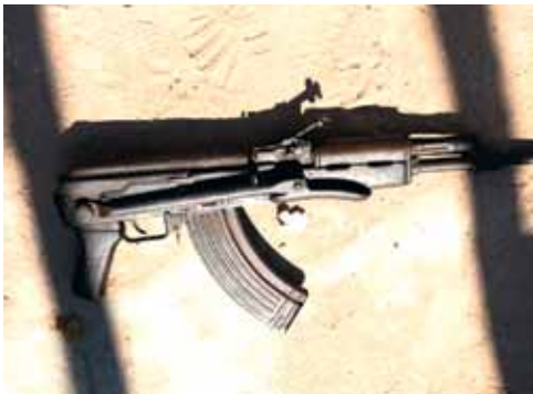
The police recovered unlicensed firearms and ammunition during the weekly ongoing operations conducted in the province.