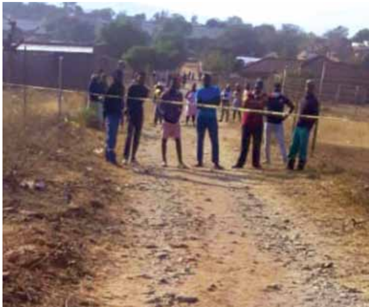
Community members observing a crime scene where two men were found murdered at Madiseng Village.