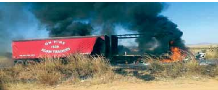
Passing trucks were set alight during a series of demonstrations that led to the arrest of the three community members.

higher daily wages and equal employment opportunities from the main contractor. Since the suspension of the project, a series of protests were organized resulting in a closure of main roads and serious damage of government infrastructure and public property. A number of houses and vehicles belonging to residents who are believed to be supporting the main contractor were set alight. The suspects were released on R1000-00 bail each and will appear again on 11 October 2021, pending further police investigation. A community leader, who did not want to be named, told the Dispatch that they were demanding the release of the suspects because they have done nothing wrong. “We want them released because they were fighting to serve the interests of the majority. We demand the contractor to pay standard rates of R250-00 per day instead of R180-00,” he said. He lambasted the Makhuduthamaga Local Municipality for failing to intervene to resolve the problems between the contractor and residents. “The mayor was informed about the challenges but she did nothing. We are protesting because