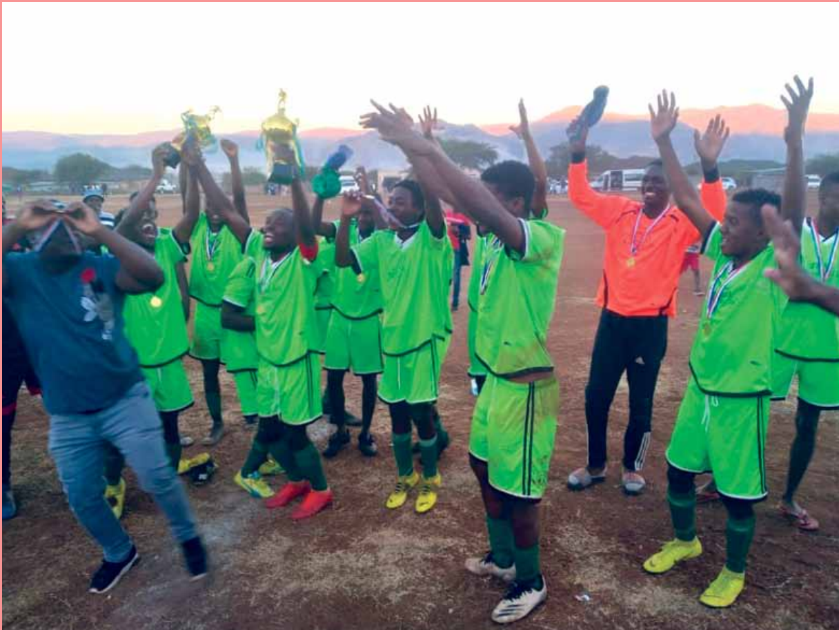
Sekhukhune Regional representatives, Mamatho United FC, were knocked out of the provincial promotional playoffs competition after obtaining the third position.

Mamatho FC, which was representing Sekhukhune in the SAFA Provincial Promotional Playoffs, was knocked out of the competition after obtaining the third position in the competition.