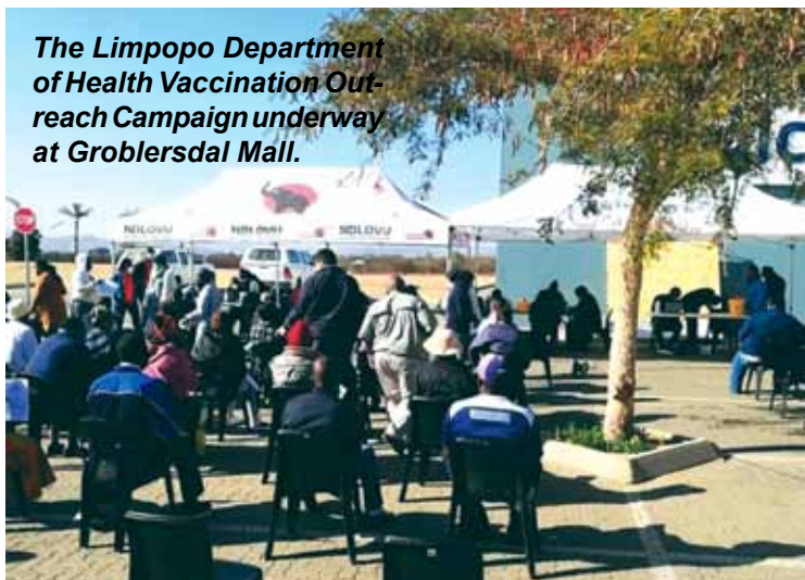
The Limpopo Department of Health Vaccination Outreach Campaign underway at Groblersdal Mall.